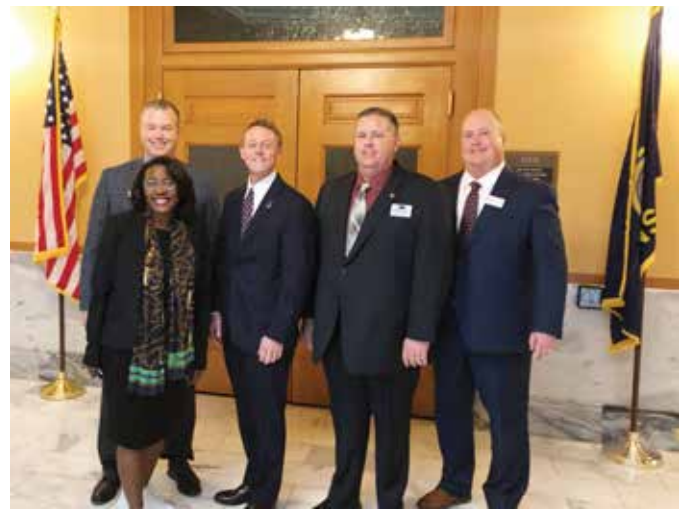
Schools Represented by Superintendent: Shawnee Heights, Topeka Public Schools, Auburn-Washburn, Silver Lake, Seaman

Our Shawnee County legislators had great questions and concerns about teacher vacancies, substitute teacher availability, improving our schools, and how we can stay better connected throughout the legislative session. I want to thank our Shawnee County Delegation for their commitment to helping us improve our school communities. When we work together, we begin to realize greater opportunities to make "Learning Without Limits" possible for all of our students.